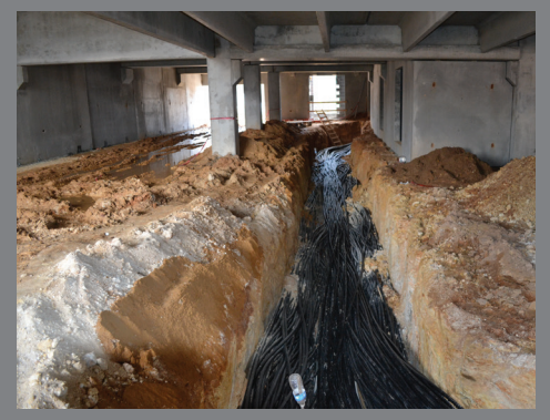
Through parking garage for new apartment complex.