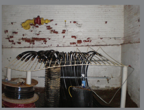
Factory conversion for condos.