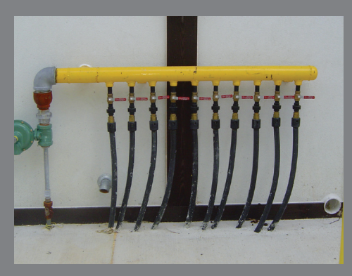
Gas stove for restaurant.

The flexibility and long lengths of TracPipe PS-II allowed for a total install time of just 36 hours versus an estimated 1200 hours for black iron pipe.