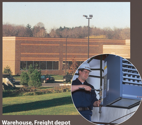
Warehouse, Freight depot