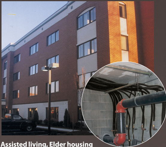
Assisted living, Elder housing