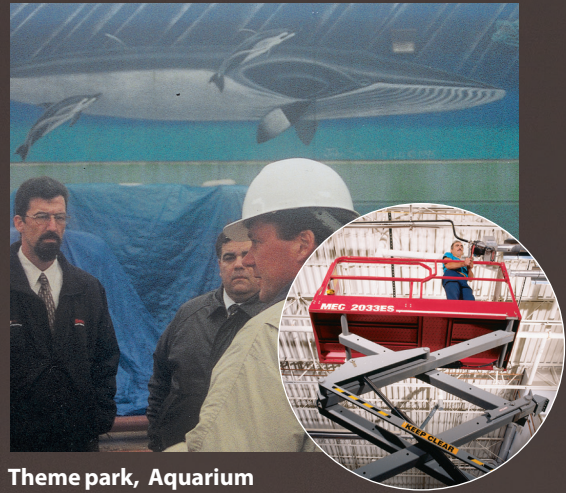
Theme park, Aquarium